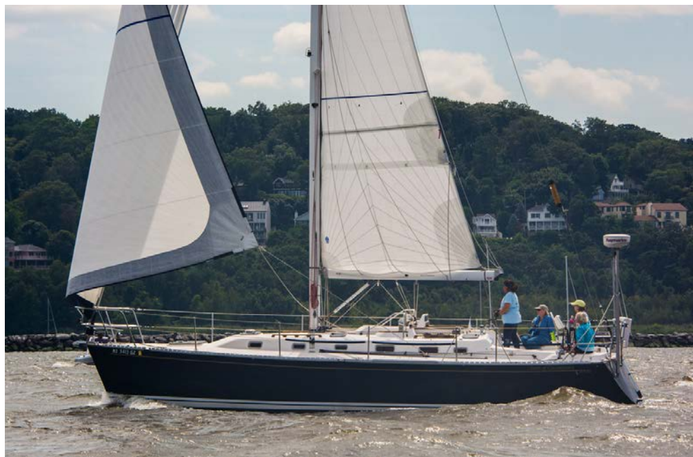
Saint of Circumstance took first place in the Non-Spinnaker division for the second year in a row.

the race, on the water, the thirteen Ms. Race teams from different clubs around the Bay Area did some picturesque last minute