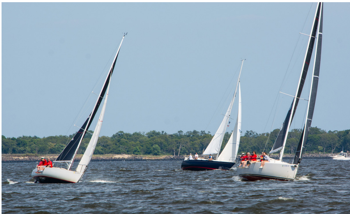
Thirteen all-women teams competed in the 19th Annual Ms. Race.

A sailboat race for women only, the Ms. Race, hosted by the Atlantic Highlands Yacht Club (AHYC) in Atlantic Highlands,